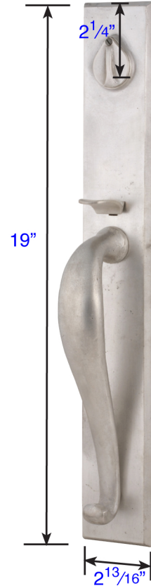
Rectangular Full Length Part # 451613