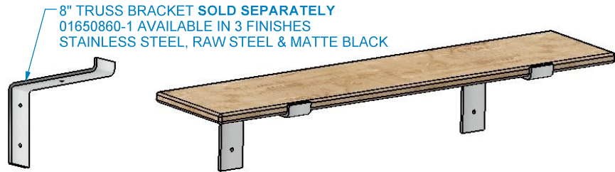
8" TRUSS BRACKET SOLD SEPARATELY 01650860-1 AVAILABLE IN 3 FINISHES STAINLESS STEEL, RAW STEEL & MATTE BLACK