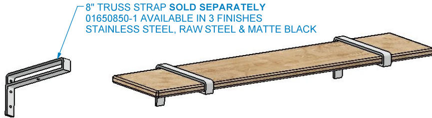
8" TRUSS STRAP SOLD SEPARATELY 01650850-1 AVAILABLE IN 3 FINISHES STAINLESS STEEL, RAW STEEL & MATTE BLACK