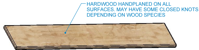
HARDWOOD HANDPLANED ON ALL SURFACES. MAY HAVE SOME CLOSED KNOTS DEPENDING ON WOOD SPECIES